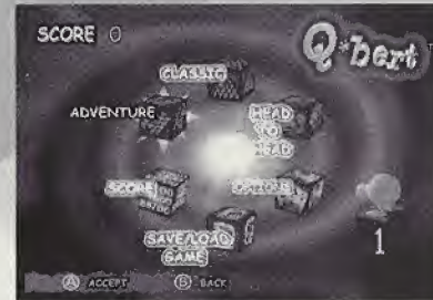
Main Menu Screen

This option allows you to save the status of your current game, as well as load a previously saved game. Please refer to "Save / Load Game" section of this manual on page 10.